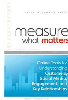
Paine (2011). Measure What Matters .